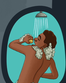
Have a shower or bath everyday.